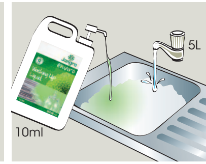
Dilute 10ml of liquid per 5 litres of hot water.