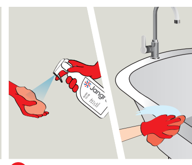
4 Spray cloth and wipe clean surface.