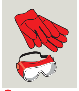
Use appropriate PPE as indicated in the Safety Data Sheet.