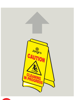
Once surface is dry remove Safety Signs.